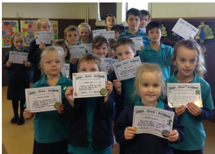
Last week's Principal Award winners with their newly designed certificates.