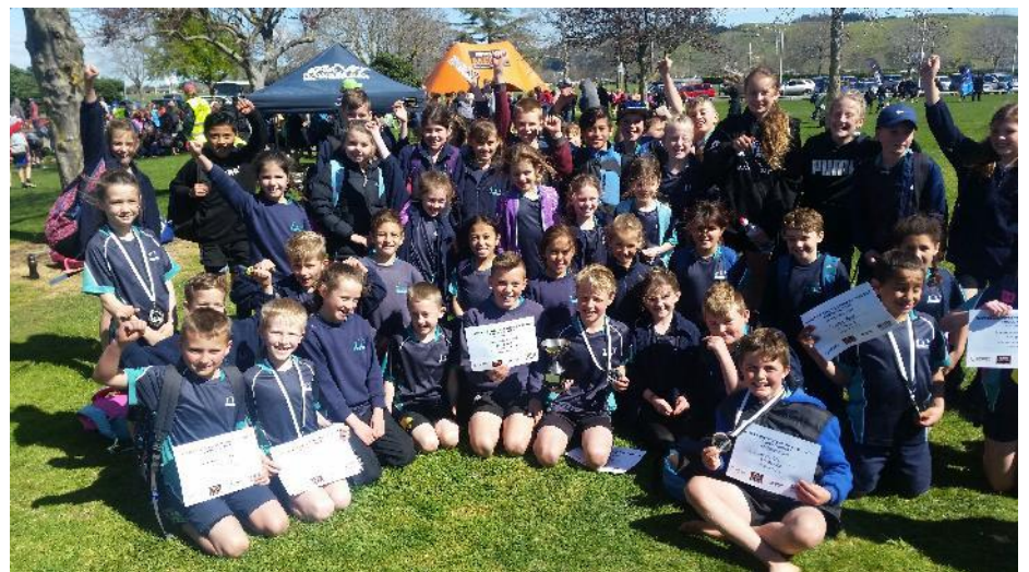
Pictured: The entire team of runners – all 48 who represented Greenmeadows School and took out the Napier champs!

Each of the runners who finished in the top 30 of the races on Tuesday are able to enter into the Hawkes Bay Cross-country champs