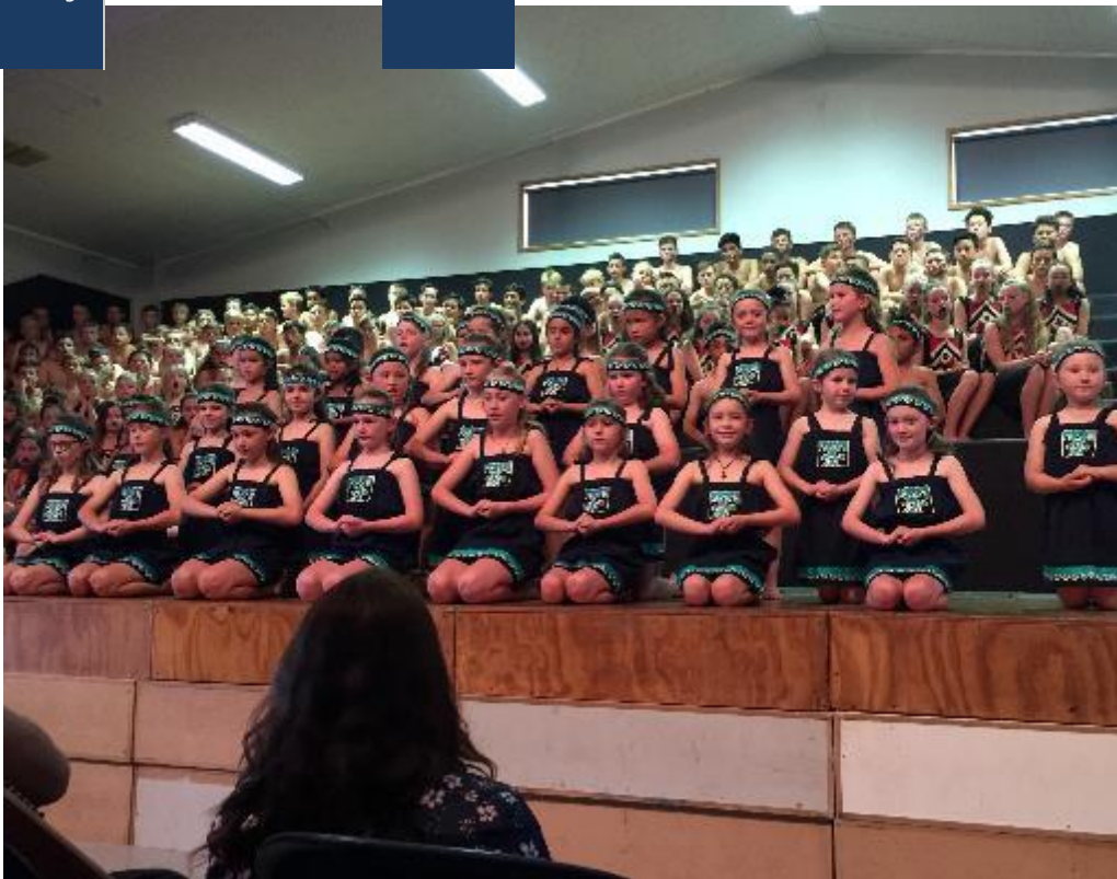
Pictured: Our Kapa Haka group performing in the Taradale Schools festival in Week 2.

2018 we will have our school hall back once all the renovation work is completed in Rooms 14 to 17. It will be great to have options for assembly that can cater for all weather conditions!