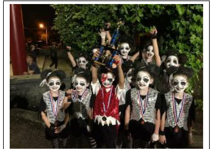
The Jump Jam team with their trophy!!!!

The number of children playing in the wide range of sports this term is amazing!!! Great to see so many of our tamariki out and keeping active. Thanks to all the coaches and managers who are there giving up their valuable time.