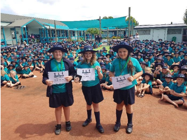
Scenes from our last assembly on 30 November!!!!