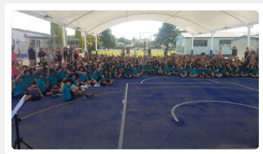
We all fit!!

The children singing the waiata 'Tūtira Mai Ngā Iwi'.