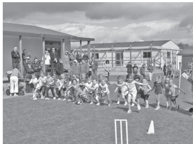
Above: The start of the Year 1 girls race with an enthusiastic and large field setting off to a great pace.

Last week the junior classes cross-country event was held at school. It was marvellous to see all the children running and giving their best in the cool conditions. And what a turnout of parents! Thanks for coming along to support our children in their efforts - all that training paid off, and it was great seeing so many children able to run the entire distance.