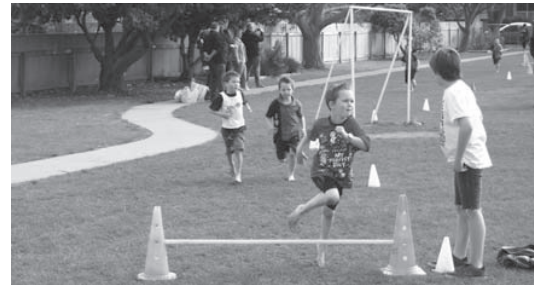
Left: Action from the front of the Year 1 boys race from last week's junior cross-country.