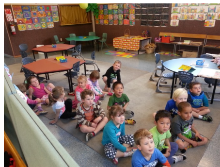
Left: Room 18 in full flight!!!! Look at all those delightful faces.